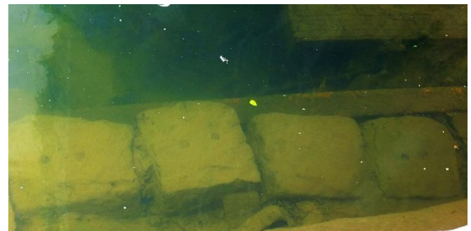
These stone blocks were recycled by the PRR for the foundation of the 1862 bridge and can still be seen in the water of the Brandywine River. The blocks, which predated the use of wooden railroad ties, once held the rails for the original Philadelphia wooden pegs which held down a metal plate on top of which the iron rail was placed.