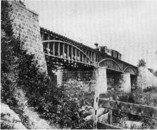
This photo, taken in the 1870s, shows the iron bridge built by the PRR in 1862. It replaced the wooden bridge built by the Philadelphia and Columbia Railroad.