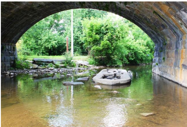
These stone foundation of the 1862 bridge can Still be seen in the Brandywine under the Current bridge.