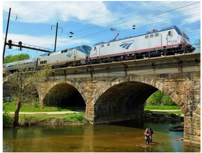
Two fisherman try their luck in the Brandywine bridge, River as an eastbound Amtrak train roars over the viaduct. It was built in 1892, replacing one built In 1862.