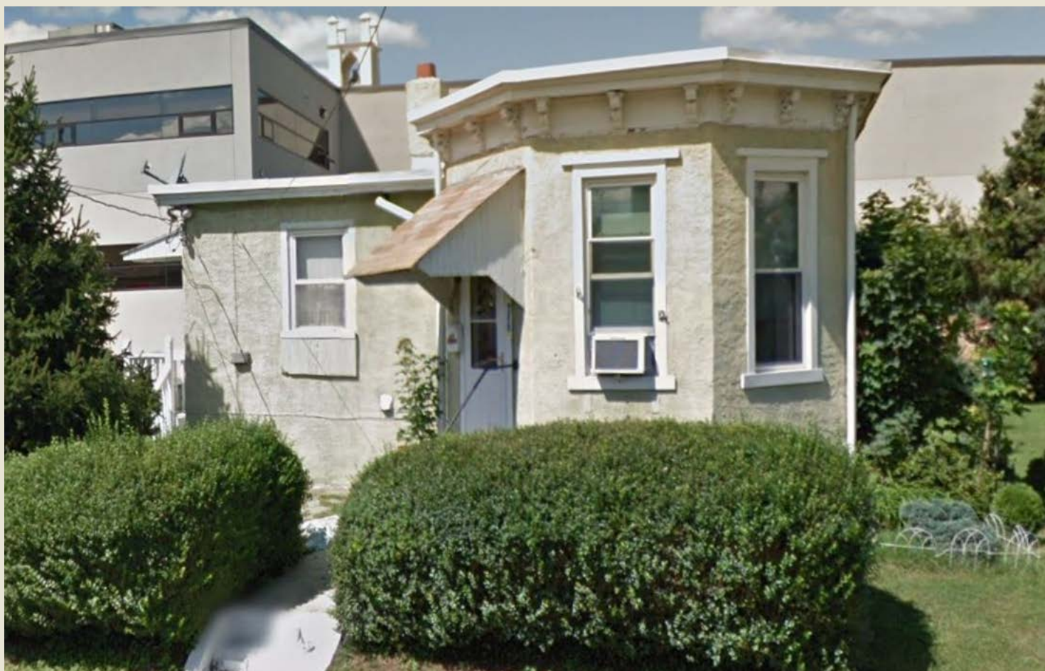
The above image of 255 Washington Avenue in Downingtown was taken from the 2012 Google Street View.

There are a number of little mysteries in the Downingtown area that have caught our interest, one of which is the origin of a small house on Washington Avenue. If you have ever driven through this area you may have noticed this unique, one-story structure on the north side of the street behind Dane Décor. This house is 255 Washington Avenue and has a three-sided front, tall windows, and decorative roof corbels. One side of the three-sided front has a door with an overhang. The structure has a flat roof. Attached on the west side is a simple flat-roofed addition that lacks that character of the main portion of the house though it appears to be from the same era.