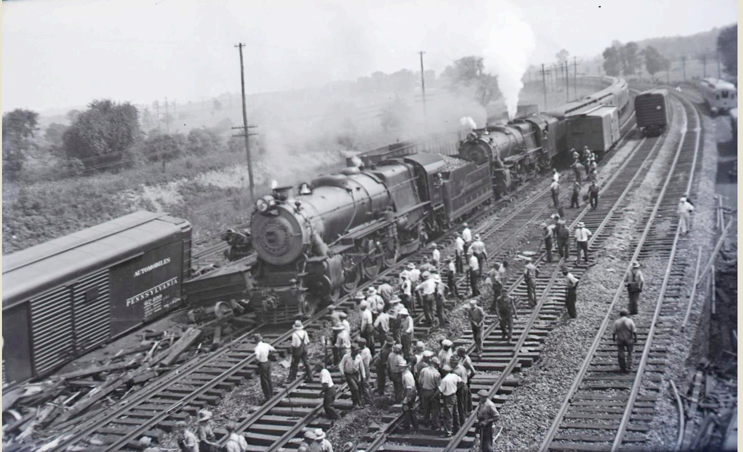
The large gang of railroad workers cleaning up the derailed railroad cars paused for a moment when a train passed the site. The photograph was taken facing east from the old Chestnut Street Bridge.

By now, an assistant trainmaster from Lancaster named Wiltsie was apprised of the situation and he and Raysor jumped into action. First, they moved two acetylene tanks left near the gunpowder-laden boxcar by welders earlier in the day. The tanks were so hot the men burned their hands. Next, despite the entreaties of nearby workers, Raysor and Wiltsie ran to a locomotive that was used in clearing the wreckage. Wiltsie jumped into the cab and Raysor swung onto the step of the coal tender. While Raysor directed, Wiltsie backed the locomotive into the siding, hooked onto the boxcar which was now smoldering, and the two men pulled it a half mile to the east where the fire department from a safe distance doused it with water from their hoses. A major Downingtown disaster had been averted.