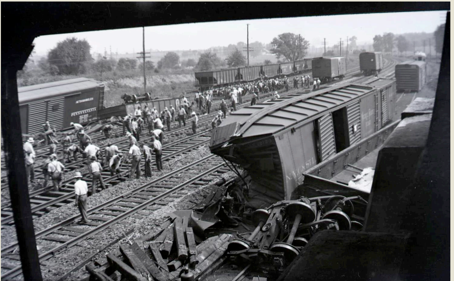
Above, the photographer took an image of the clean-up from under the bridge. The image below was taken on top of the bridge facing west. Some of the derailed cars were pushed off to the side so train traffic could resume on the Main Line. The sidings on the left served the Downingtown Paper Company. The company's smokestacks can be seen in the background.