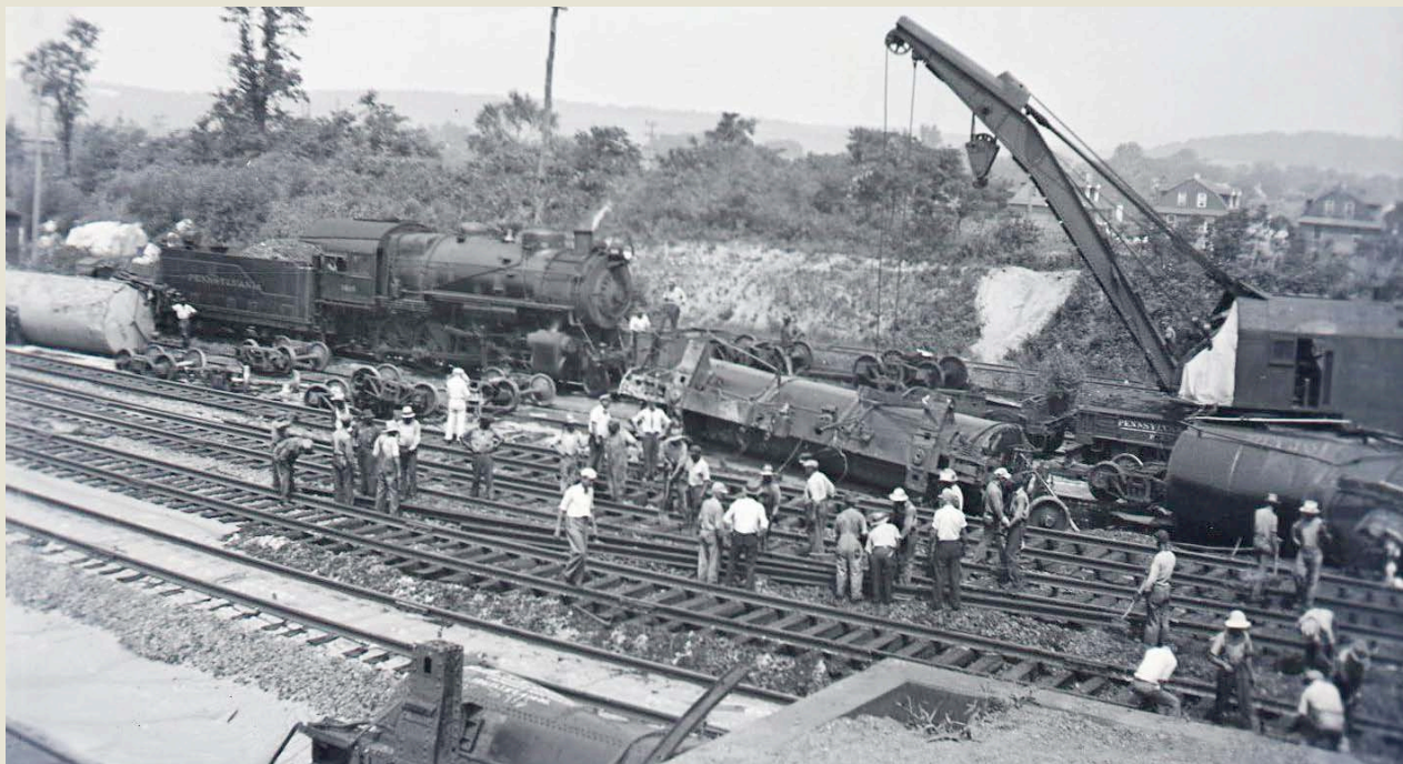
Workers are seen here on August 13, 1936 cleaning up an 18-car train derailment in Downingtown's east end at the Chestnut Street Bridge. Homes along the north side of Jackson Avenue can be seen in the background.

Despite being in the middle of the Great Depression, railroad traffic along the Pennsylvania Railroad's Main Line remained busy in 1936. Just after midnight on August 13th of that year, a train with a mix of box cars, tank cars, and gondolas roared past the station in Downingtown's west end heading toward Philadelphia. As the train approached the Chestnut Street Bridge in the Borough's east end, one of the crew members felt something was wrong when he heard an object dragging from the train. Before the crew could stop the train, the dragging item caused 18 cars to derail, including some that went off the tracks under the Chestnut Street Bridge.