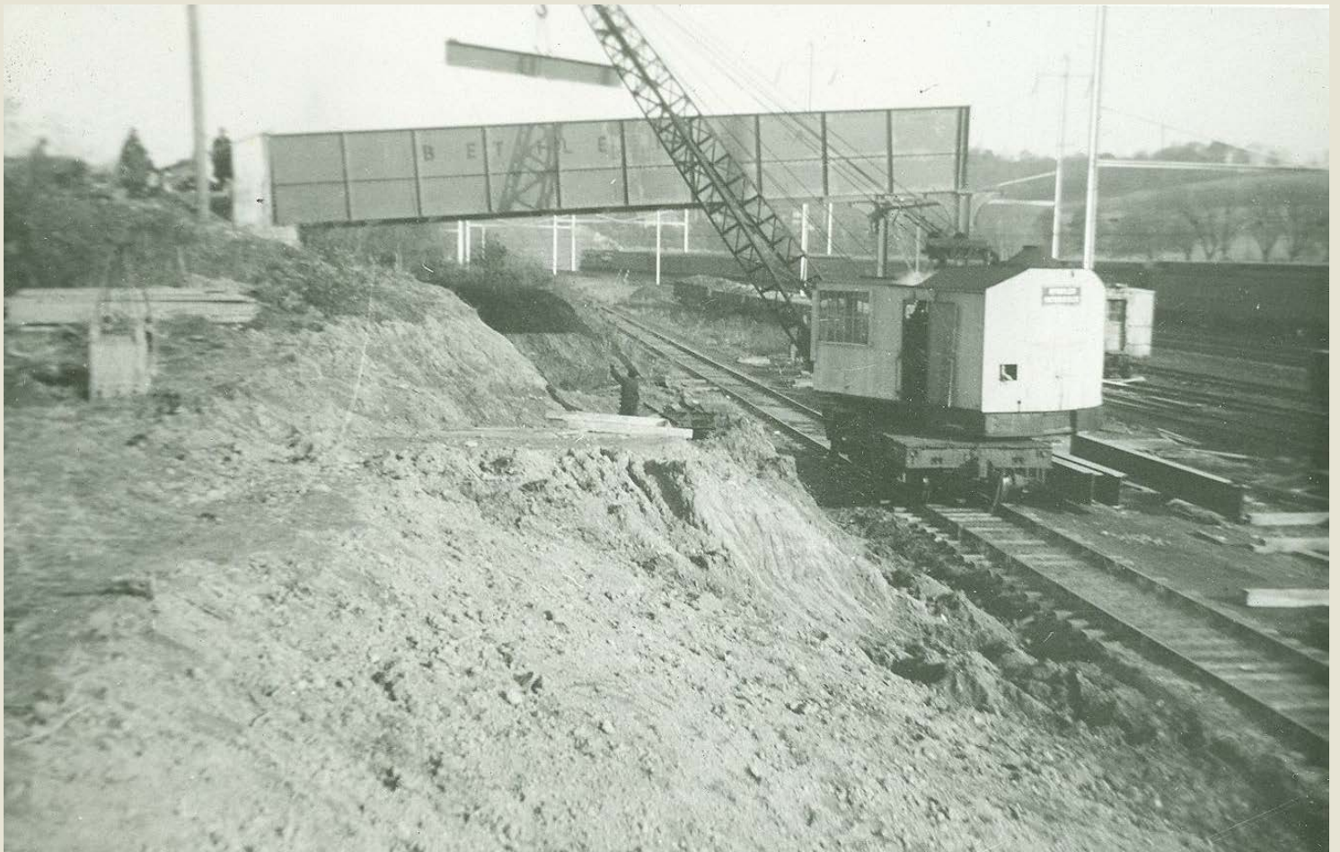
The photograph above shows the Chestnut Street Bridge under construction in the late summer or early fall of 1939. Notice the structure was fabricated by Bethlehem Steel. The crane was on the track of the Reading Railroad's Chester Valley Branch which paralleled the PRR's Main Line for a short distance in the eastern end of Downingtown. The image below shows the completed bridge. In both images, notice the new electric poles recently installed by the Pennsylvania Railroad. Electrified trains first ran west of Paoli in 1938.