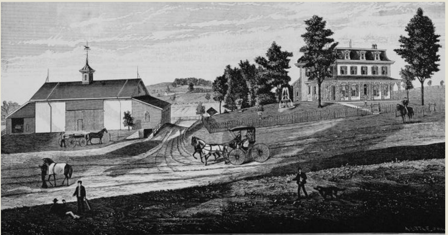
EDGEFIELD INSTITUTE. RESIDENCE OF A. FETTERS, UPPER UWCHLAN.