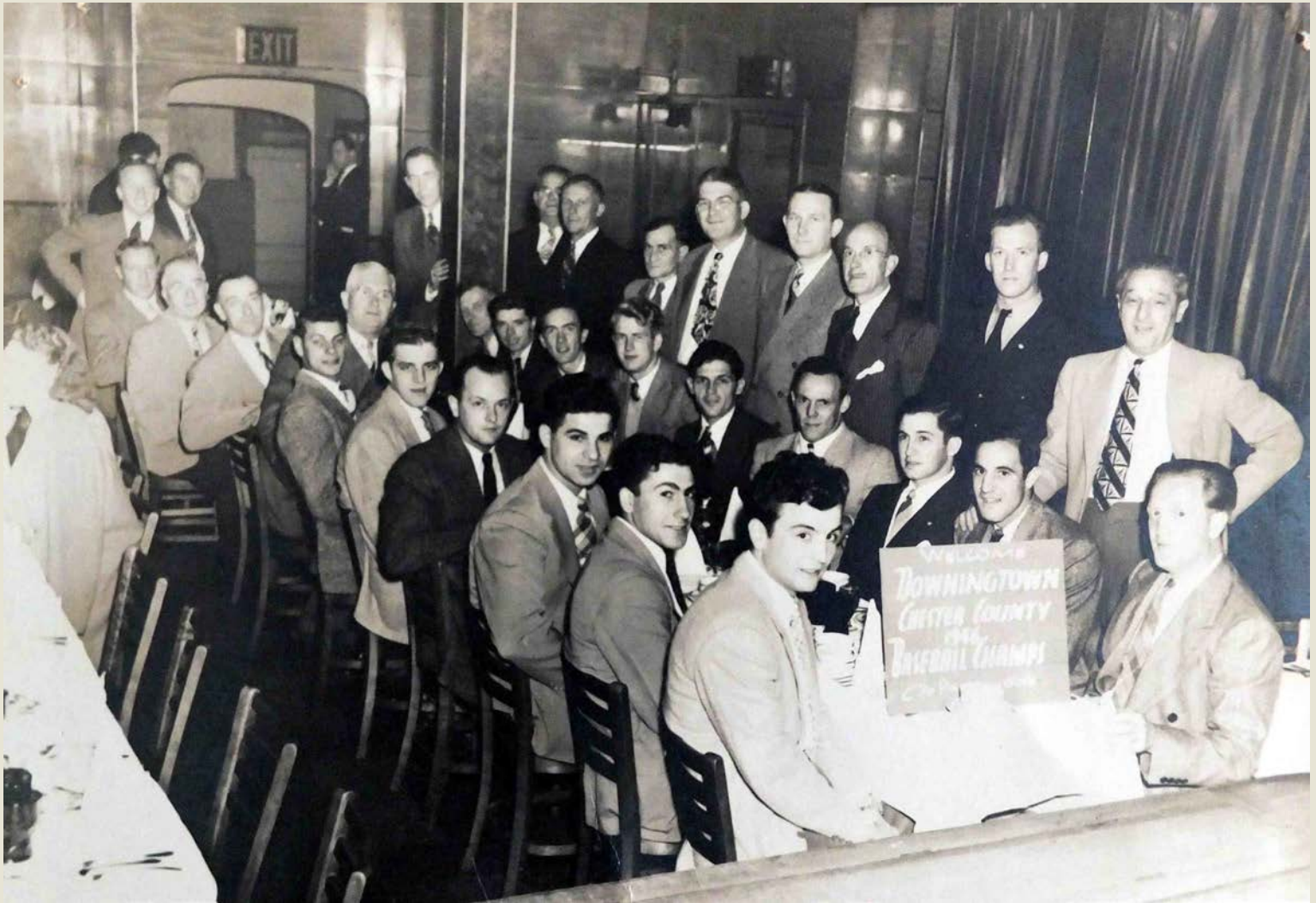
Above are members and coaches from Downingtown's 1946 baseball team celebrating their Chester County championship at Palumbo's Restaurant in South Philadelphia.